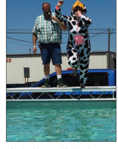
Three tons of ice was dumped into the pool for the 4th Annual Poolar Bear Plunge in Eagle River.